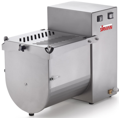
Sirman Meat Mixers , model IP 20 M :

Authorized Distributor: BS UGO-OPREMA DOO BUL.M.PUPINA 10-Z NP5 11070 NOVI BEOGRAD() TEL./FAX. +381 11 2139623 / +381 11 2145360 E-mail:ugo@eunet.rs