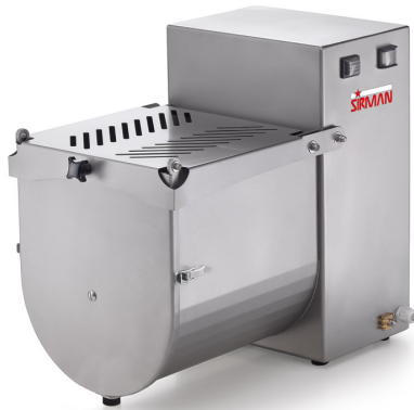
Sirman Meat Mixers , model IP 10 M :

Authorized Distributor: BS UGO-OPREMA DOO BUL.M.PUPINA 10-Z NP5 11070 NOVI BEOGRAD() TEL./FAX. +381 11 2139623 / +381 11 2145360 E-mail:ugo@eunet.rs